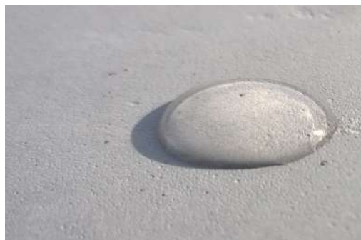
Concrete protected with COLORTEC® finish

More pictures and videos of concrete surfaces with “repelling” effects can be found in our online photo gallery and video gallery .