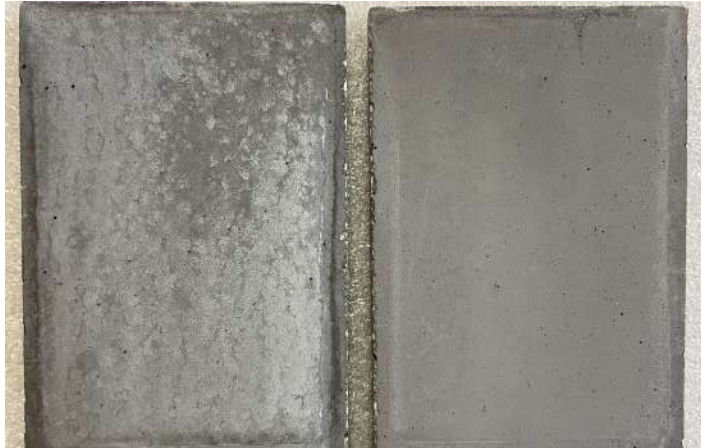
Left: not protected

COLORTEC® finish creates a water-repelling function and therefore protects the concrete surface against pollution/dirt, efflorescence, freezing damage, weathering, fading of the colour etc. and preserves the aesthetical value of the concrete surface long-term. For the protection of concrete with a special surface finish, e.g. sand-/shot-blasted, exposed-aggregate, acid-etched ..., we recommend the products COLORFRESH® intensiv, COLORFRESH® effect or COLORTEC® MAX.